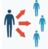
Close Contact with People